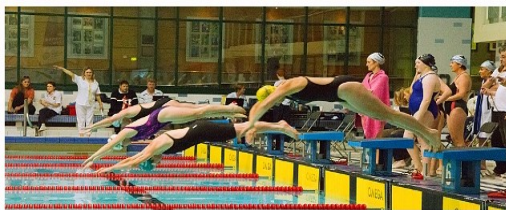
Picture: Swimmers at the Irish Open Long Course in Limerick